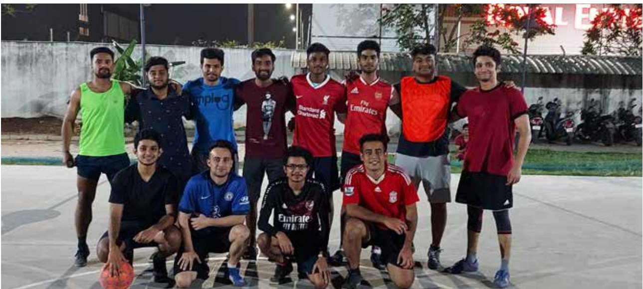
Winning Team of Basket Ball Competition

XIME Chennai also conducted a four-day comprehensive Summer sports fest, where the students actively participated in both indoor and outdoor games. The students were awarded certificates and medals for the same.