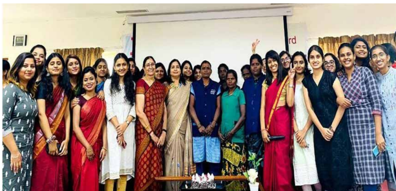
Women's Day Celebration by XIME Chennai

Women have the right to live in dignity, in freedom from fear. On this international women's day, XIME-Chennai rededicated themselves to making that a reality. The students took the initiative to make it a memorable day for all the women in the Campus. Students highlighted the strength of women through a cultural programme.