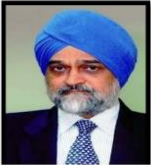
Dr. Montek Singh Ahluwalia Former Dy. Chairman, Planning Commission of India