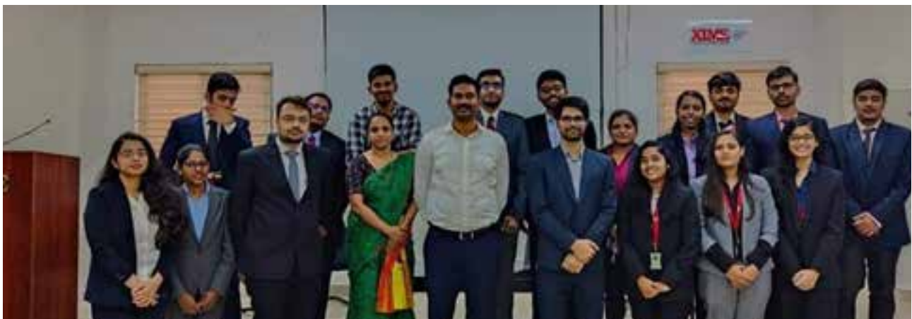
Participants at the Union budget analysis