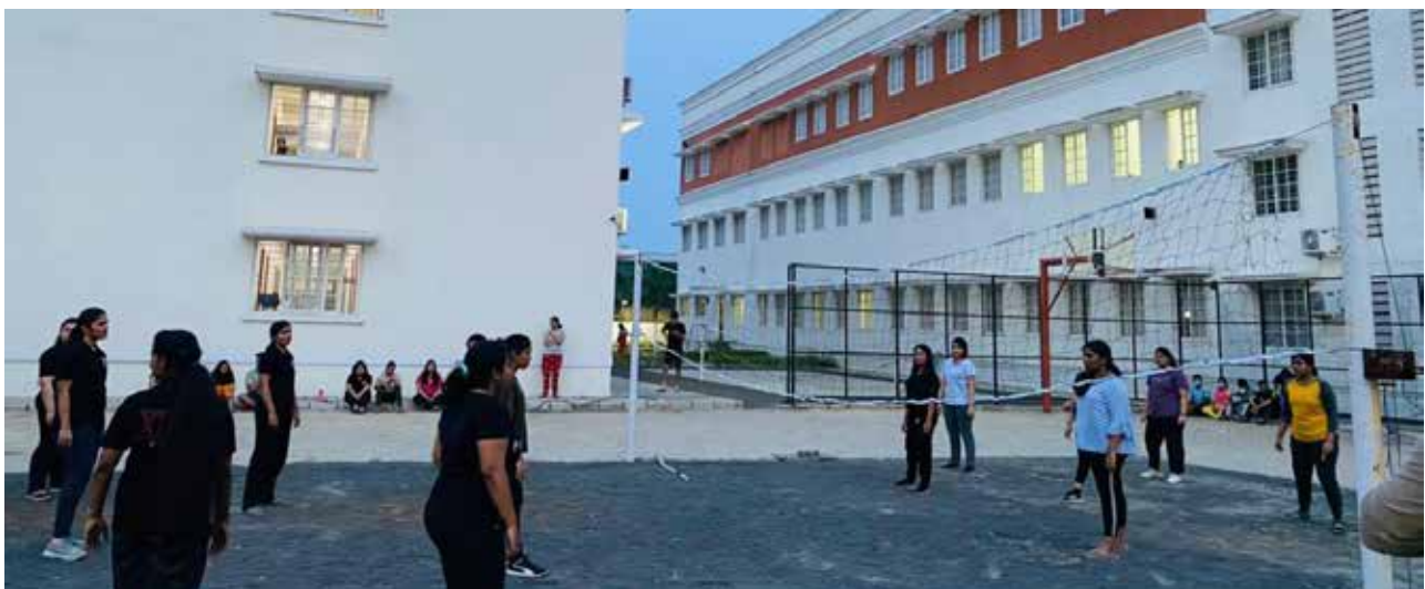
Girls Throw Ball Event in Progress