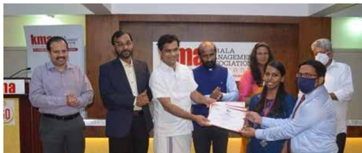
Second Prize winner of KMA budget business event