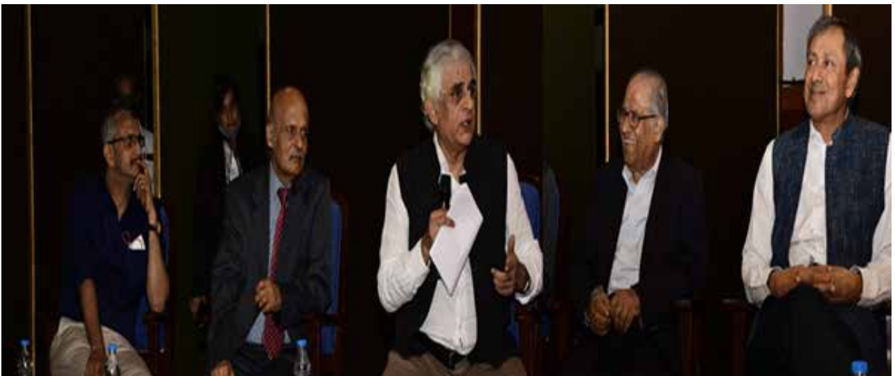
Session on 30 years of liberalisation