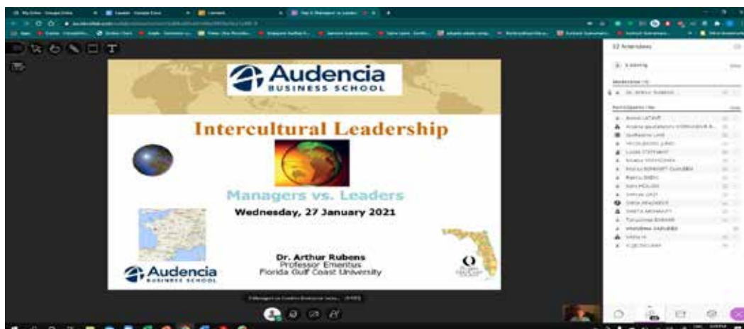
The online session of the student exchange programme at Audencia Business School