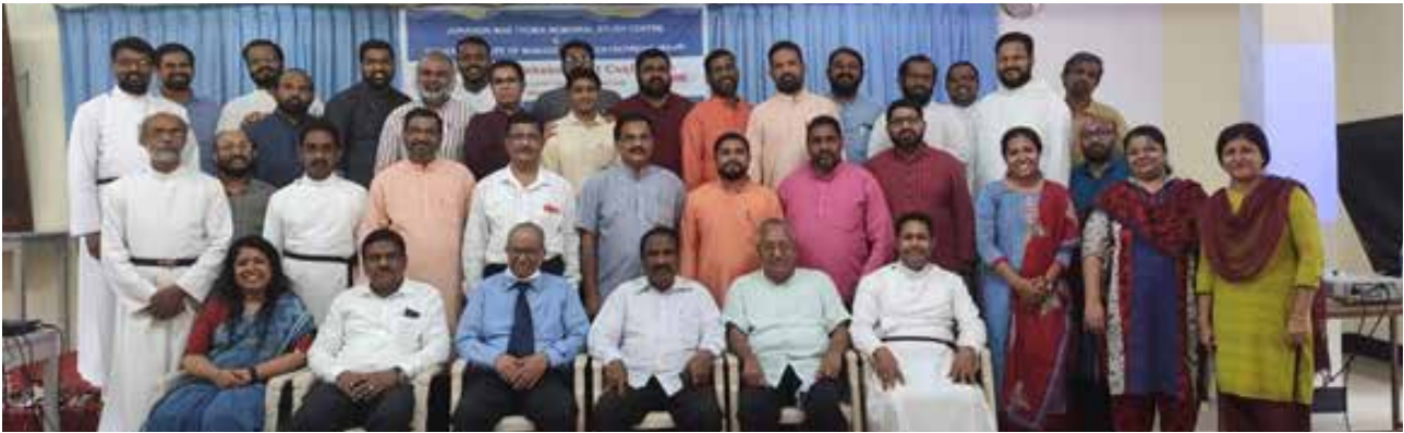
Leadership enhancement programme for Marthoma Church