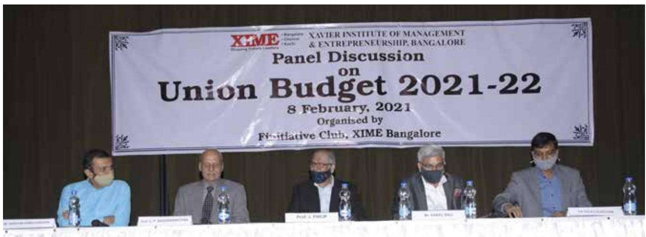
Panel Discussion on Union Budget 2021-22.